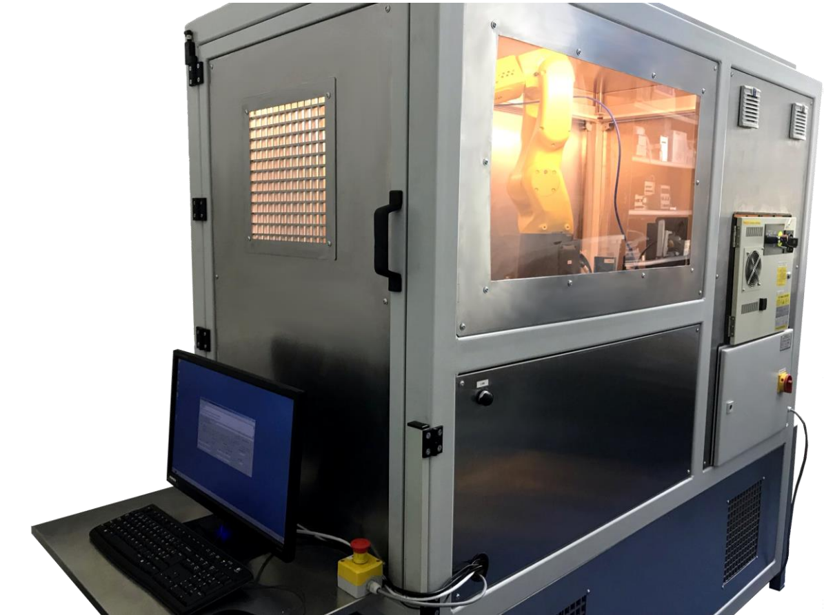
Figure 1. Appearance of PPS4S-AS

The total analysis system is computer controlled and easily operated, and measurement results are saved into a data file. Axygen® PCR microtubes with domed cap 0.2 mL (Product number: PCR-02D-C) are compatible with PPS4S-AS. For more information of sample and measurement protocol or a shipping guide of samples to Pepric for a quick preview of the performance of the instrument, please refer to the document of “sample and measurement protocol and shipping guide”.